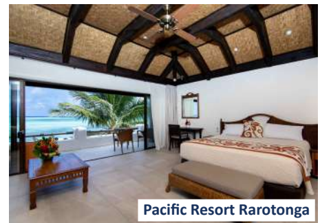
Pacific Resort Rarotonga