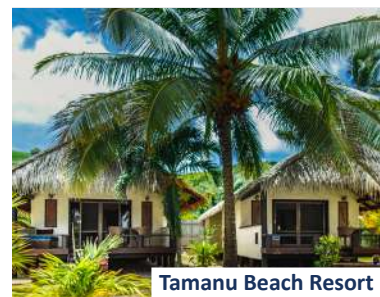
Tamanu Beach Resort