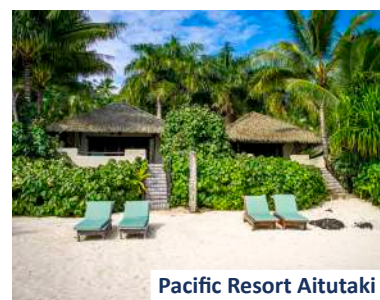
Pacific Resort Aitutaki