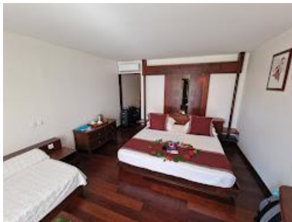
Hotel Manava Beach Resort & Spa