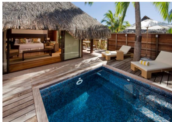
Hotel Hilton Moorea Lagoon Resort & Spa