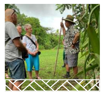
*Minimum 4 pax required on Explore Niue East Coast Tour / Explore Niue West Coast Tour

Spearfishing Charter: $560/2 pax, $616/3 pax, $672/4 pax *Minimum 2 pax required