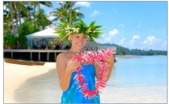
A Warm Welcome Awaits At The Rarotongan

The Rarotongan is ideal for couples, groups or families seeking to experience an authentic Cook Islands atmosphere, complete with a wide range of exciting and unique activities and entertainment.